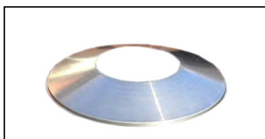
CONIC COVERING (INOX – COPPER)