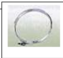
COD. SC 53 BLOCKING GIRDLE (INOX – COPPER)