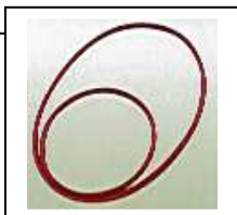
COD. SC 55 SILICONE GARNITURE